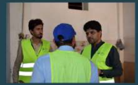
Driven by Kindness