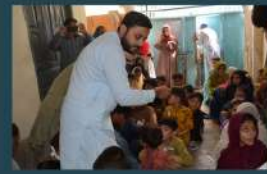
Hands of Compassion

From organizing logistics to personally delivering meat, our passionate JJT staff and teachers played a key role in ensuring every family received their share with dignity. Their selfless service brought warmth and unity to our school communities.