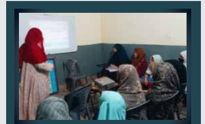
Building Confidence through Conversation

An interactive English language course was held during the summer camp for grades 6–8. Through engaging activities like sentence building, creative writing, and conversation practice, students gained confidence and improved their communication skills in a fun, engaging environment.